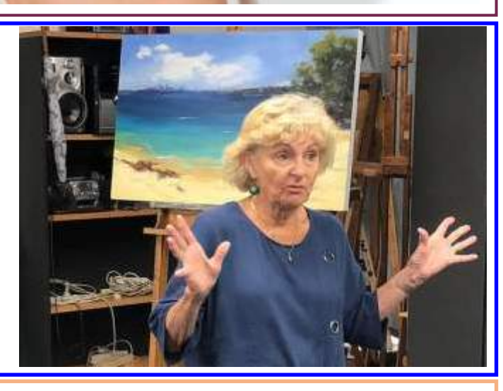
Mixing new ideas with old traditions to create a modern look.