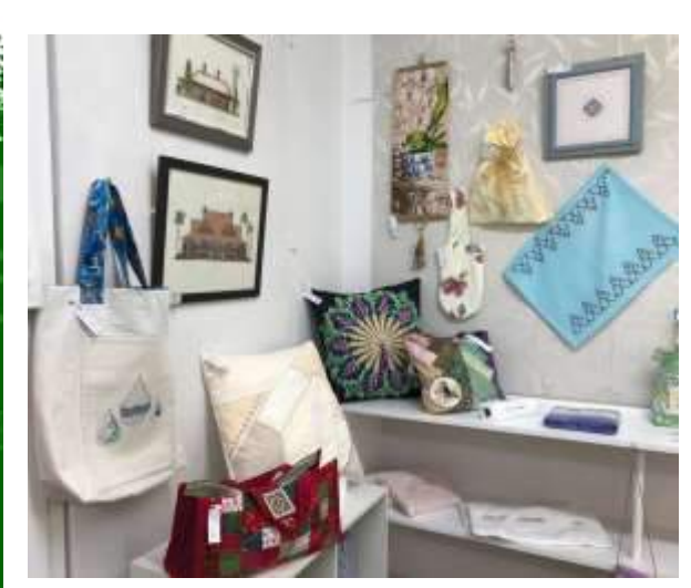
Page | 3 Cultivating Creativity & Friendship Through Community Arts & Crafts