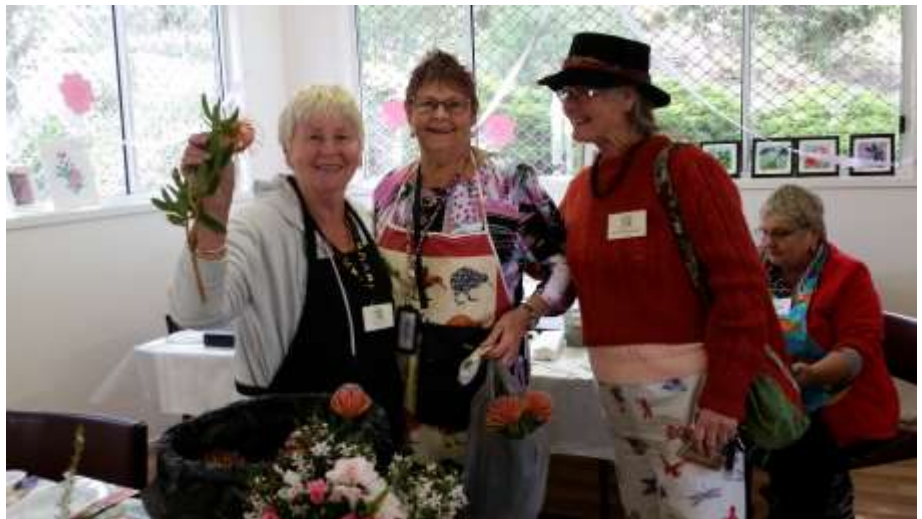
Spring Affair 2017

We would like to invite all centre artists to contribute. Each contributor is allowed three canvases or framed paintings no larger than 30 x 40 cm depending on space. At least one item is to be donated to the centre - more if you wish. Three unframed works can also be displayed as well - same conditions as paintings. Helpers will be needed in all areas during the day.