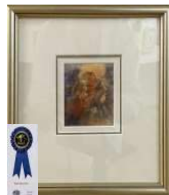
Miniatures - Sunset Supermarket by Madeleine Szymanski