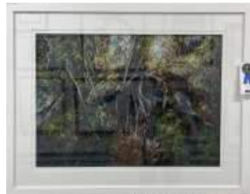
Drawing - Searching for Glow Worms by Jill Cairns