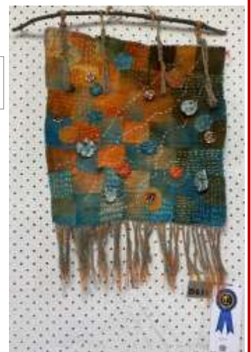
Textiles - Textile Colour & Stitch in Kimberly Colours on an Embellisher by Lesley Lewis