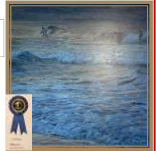
Painting - It's Coming up a Storm by Fiona Clark