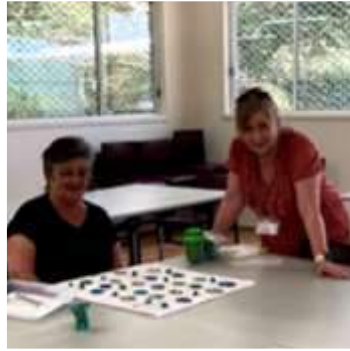
Working on a group project for a future Raffle at the Centre.