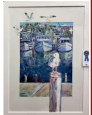
Mixed Media - Harbour by Megan Barrass